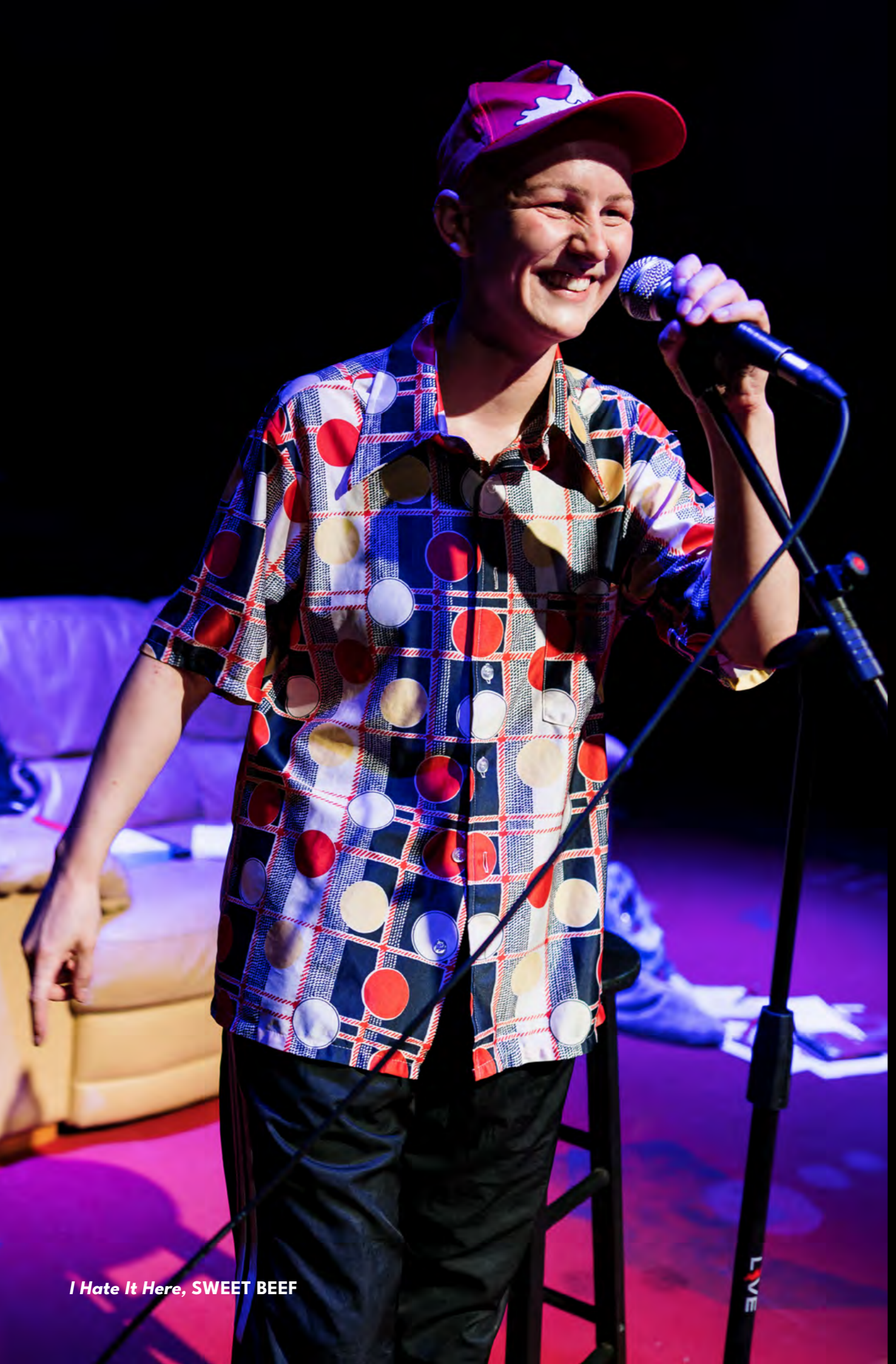
I Hate It Here, SWEET BEEF