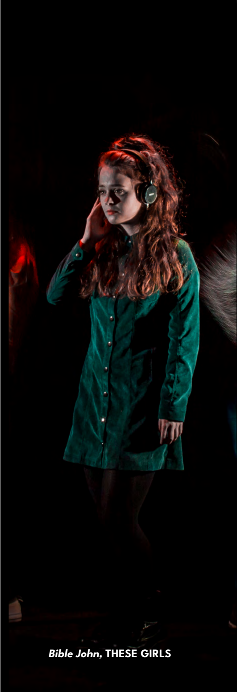
Bible John, THESE GIRLS

Sweet Beef Theatre Early Ensemble Strand Recipient 2024